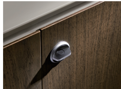
Smart Fingerprint Lock