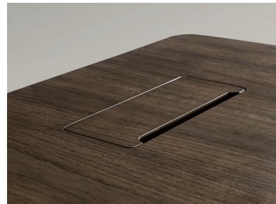
Integrated Power Box